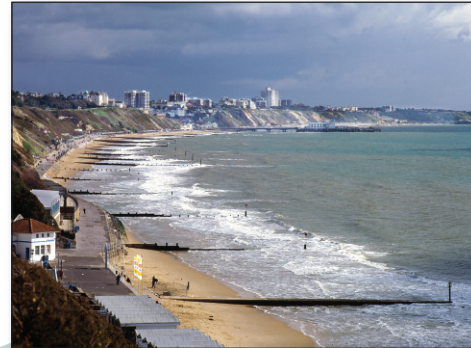
Right: Branksome Chine.