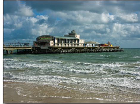
Above right: Bournemouth Pier.