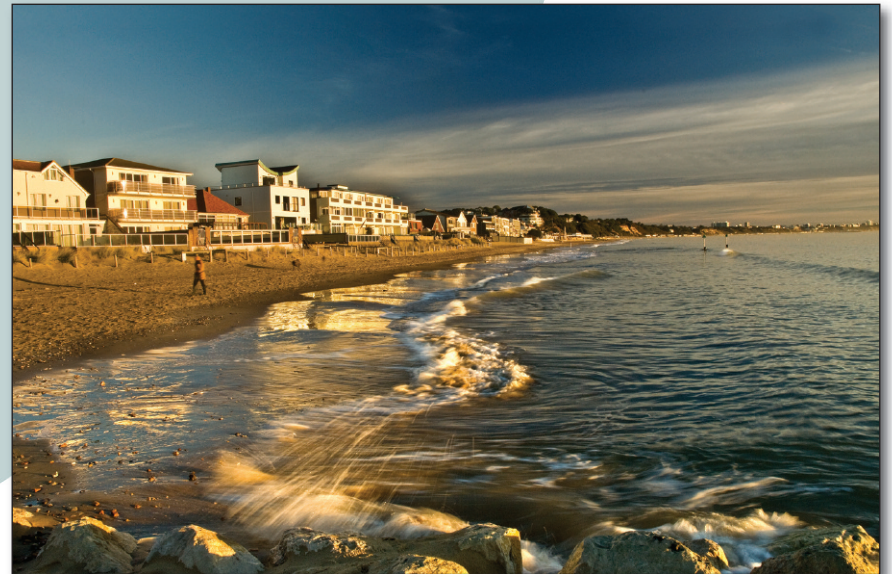
Sandbanks early morning.