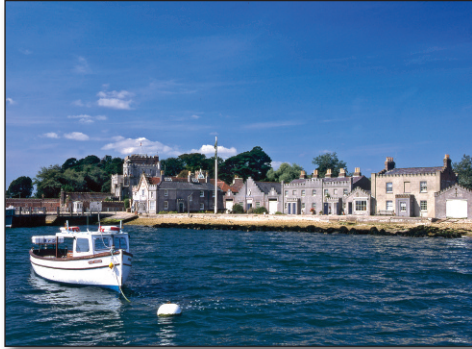
Above: Brownsea landing stage and National Trust properties.