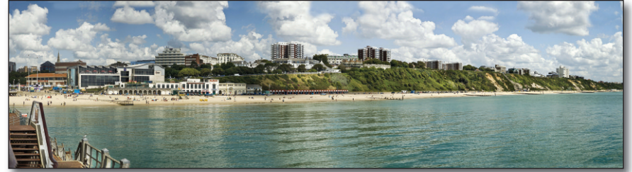
Bournemouth East Cliff.