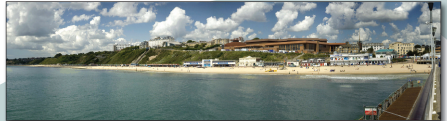
Bournemouth West Cliff.